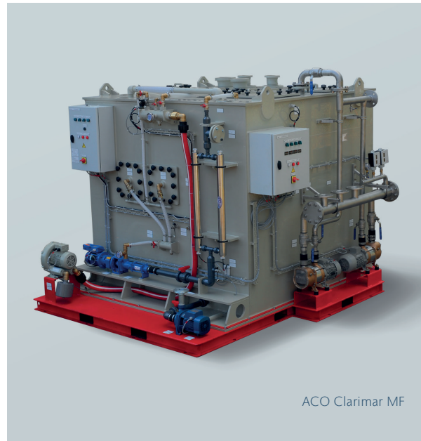
ACO Clarimar MF

The ACO Marine advanced Maripur NF (pictured left) and Clarimar MF advanced wastewater management systems have received Transport Canada type approval.